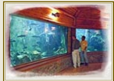
Cabela's spectacular dining room and aquarium.