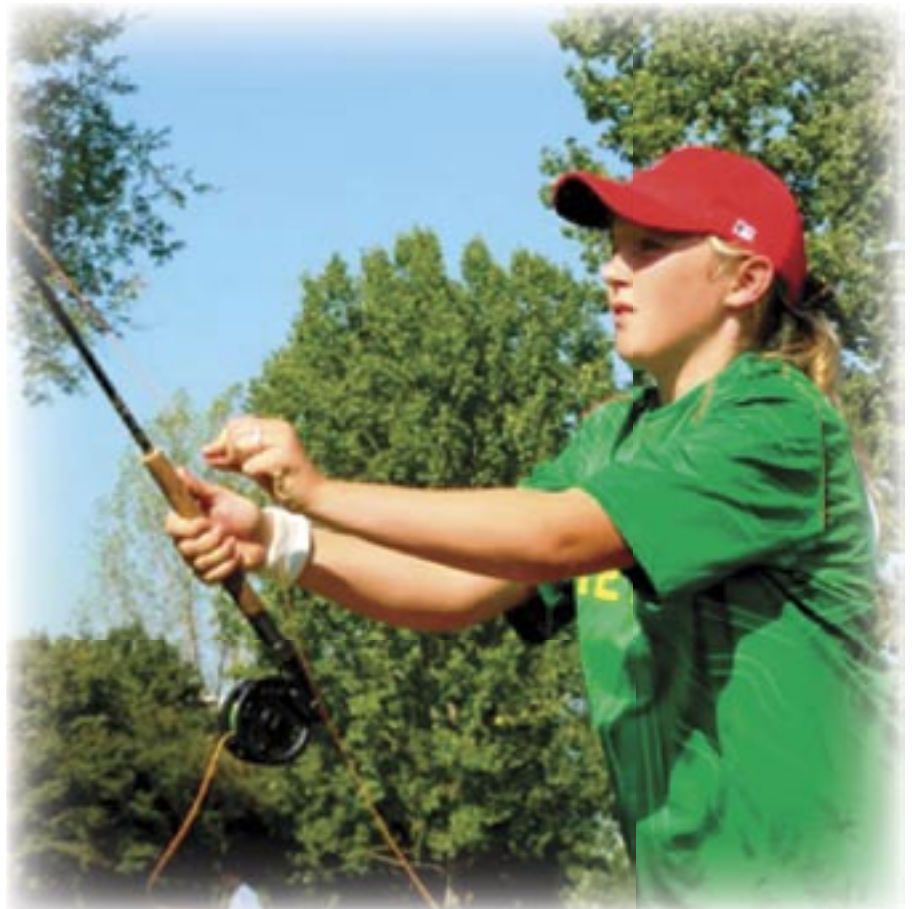
There will be divisions for men, women, boys and girls at the Masters

We're proud of the success we've had over the years and we are eager to not only continue that success but also to build even stronger relations with the ICSF in the future."