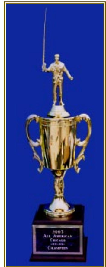
The All-American Casting Championship trophy

Online registration: http://www.discoverboating.com/boatshows/Chicago/casting/